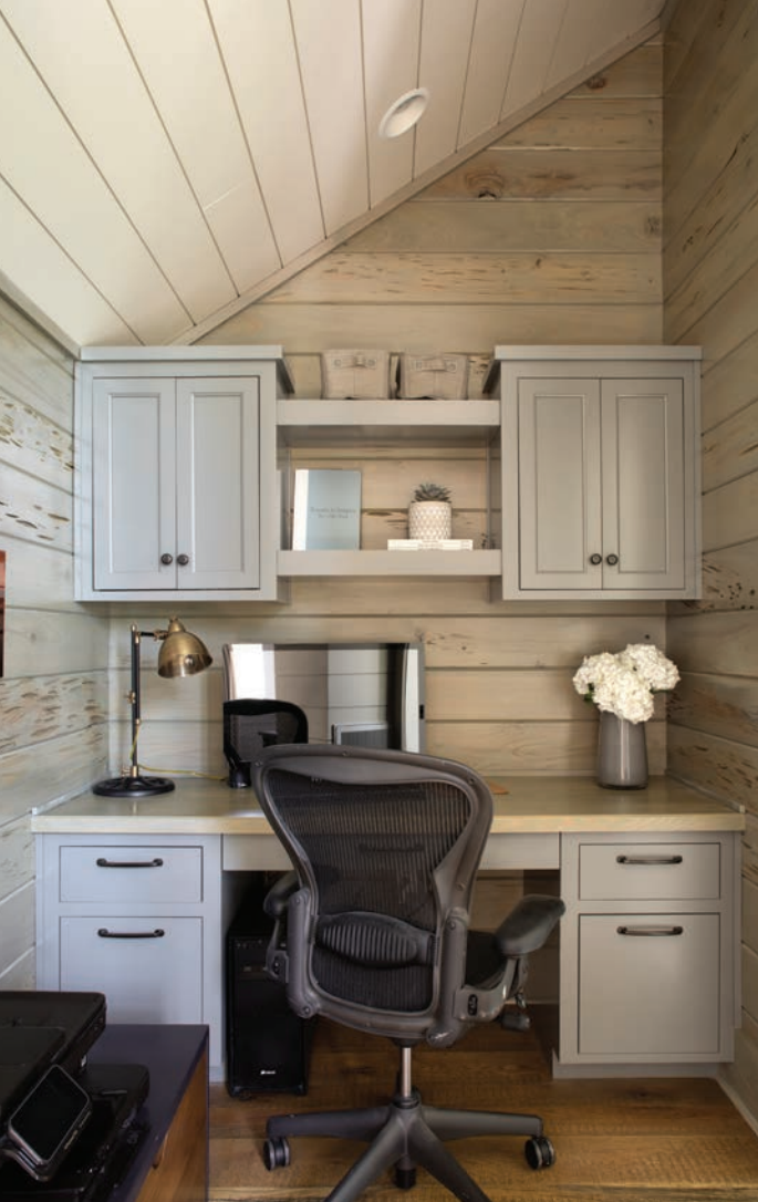
INSTALLING PECKY cypress paneling is an easy way to dress up an office space by adding detail and texture.