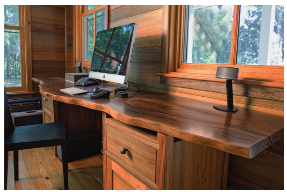
HOMEOWNERS are investing in high-quality, solid wood office furniture that's built to last, like this cypress desk with walnut slab top.