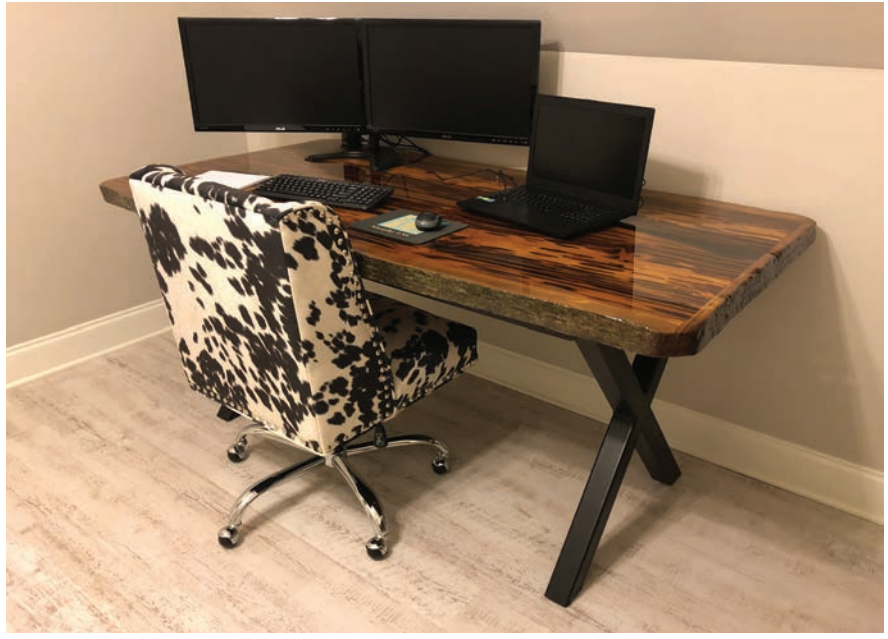
NOVICE and seasoned DIYers are getting creative by buying gorgeous cypress slabs and building their own custom desks.

When it comes to utilizing these products in home offices, Zack