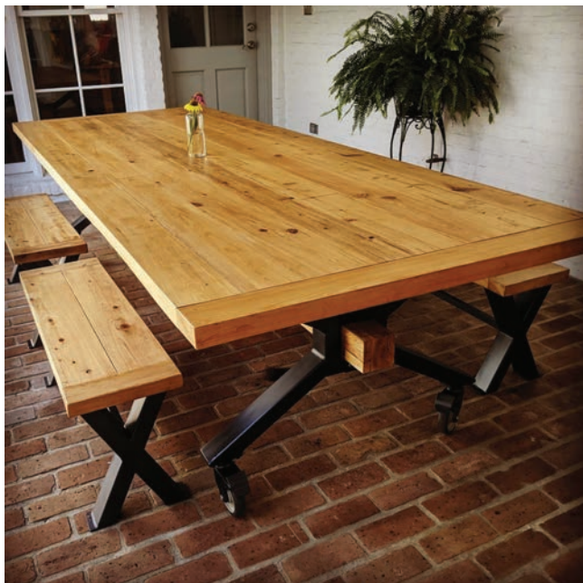
OUTDOOR TABLE and companion benches were built of southern cypress and finished with a light stain.

And when it comes to wood alternatives, like polywood and plastic, Peugh says there hasn't been much competition. "In my experience, people choose cypress for three reasons. First, cypress has better thermal properties and it won't heat up like alternative materials. Second, it's more durable and will last for many years. People think polywood will last forever, but it gets brittle and will break. And lastly, cypress is less expensive than wood substitutes—which is surprising to many customers.