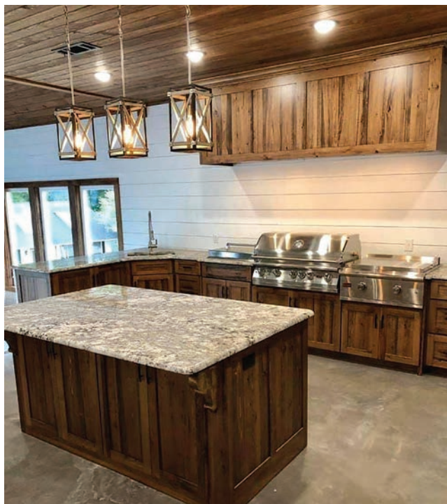
RUSTIC LOOK of cypress is right at home in many outdoor kitchens.