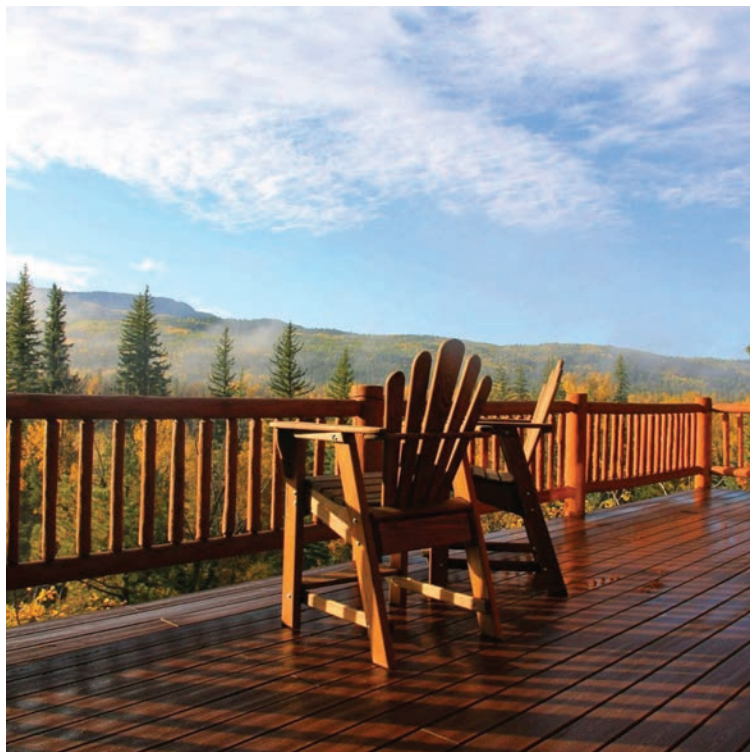
OUTDOOR FURNITURE made of cypress offers improved aesthetics, thermal properties, and durability.