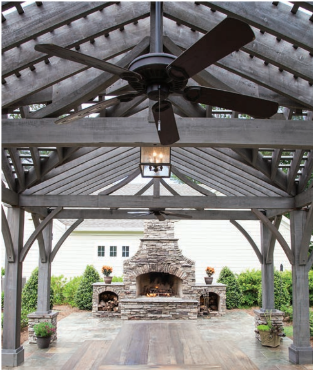
GROWING TREND: Cypress provides a vintage, rustic look that's a growing trend with homeowners, as well as the desire to bring the inside out.

"Cypress is growing to be more and more of a popular building product in the Southeast and is increasingly sought-after all over the country because it's naturally durable and doesn't need to be pressure treated," says Tripp Josey, Josey Lumber Co., Scotland Neck, N.C. "The cypressene oil that cypress trees produce in their heartwood acts as a preservative, protecting the wood from nature and making it resistant to decay. It's an attribute that makes cypress a great choice for outdoor applications like pergolas."